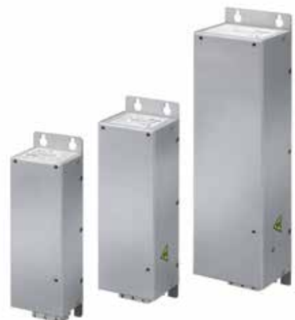
Frame sizes Three different frame sizes of line filters correspond to the M1, M2 and M3 enclosures of the VLT<sup>®</sup> Micro Drive